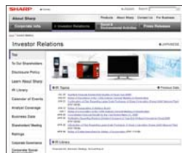
Investor relations Web site (top page)

The valuable feedback gathered from investors and analysts at these meetings is regularly relayed to Sharp management for future improvements.